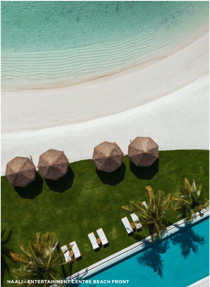
HAALI - ENTERTAINMENT CENTRE BEACH FRONT