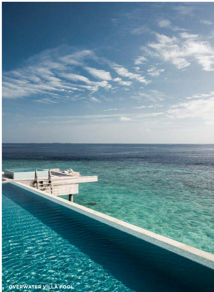
OVERWATER VILLA POOL