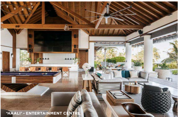
'HAALI' - ENTERTAINMENT CENTRE