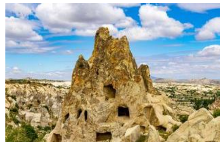
Turkish Delight 14 days | Istanbul return Highlights: Visit natural wonder Pamukkale and Cappadocia.