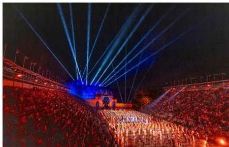
The British Isles in Depth 23 days | London retron Highlights: Royal Edinburgh Military Tattoo for selected departures in Jul-Aug