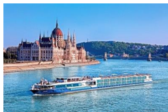
多瑙河 Danube River 歐洲第 2 最長河流(長達 2857 公里)、中歐及東歐河道重要樞紐。源於德國黑森林。流經多達 10 個國家如奧地利、斯洛伐克、匈牙利、克羅地亞、塞爾維亞等。