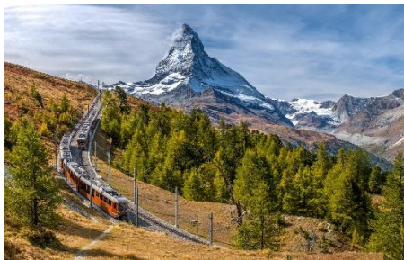
Scenic Switzerland by Train 9 days | Zurich retron Highlights: Journey aboard the Glacier Express to St. Moritz