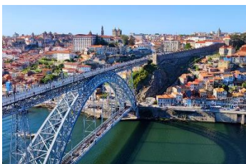
新行程 杜羅河 Douro River 位於葡萄牙北部的港口城市波多 Porto 及上杜羅葡萄酒產區 Alto Douro Wine Region 為 UNESCO 世界文化遺產。杜羅河谷以盛產葡萄牙國寶級酒以聞名