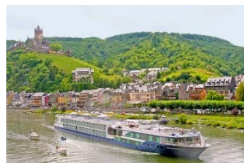
摩塞爾河 Moselle 著名白葡萄酒產區。長約 545 公里。屬萊茵河支流。流經法國、德國及盧森堡。於德國 Koblenz 德意志角匯入萊茵河。河谷旁的葡萄山園景色迷人。