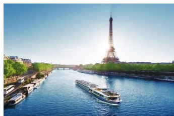
塞納河 River Seine 源於法國葡萄酒產區 Burgundy。法國第 2 最長河流(長約 776 公里)、流經中北部城市 Troyes 及巴黎市中心、巴黎更有多達 37 座橋梁橫跨塞納河。