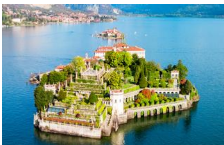
Italy's Best 14 days | Rome retron Highlights: Visit Lake Maggiore and Archeological Site of Pompeii.