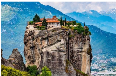
Classical Greece 8 days | Athens to Athens Highlights: Visit the beautiful monasteries of Meteora.