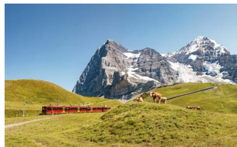
Spectacular Switzerland 9 days | Zurich return Highlights: mountain train ride to "Top of Europe" Jungfrauoch Massif