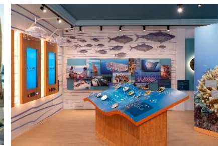
Marine Discovery Centre