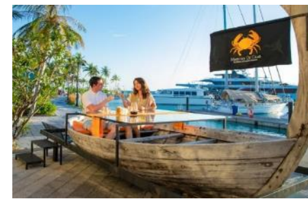
The Ministry of Crab