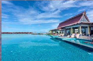
Breeze Pool Bar