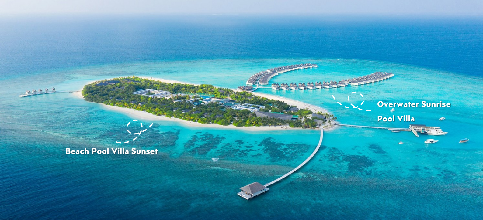
Beach Pool Villa Sunset