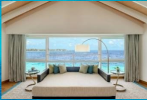
Duplex Villa upper living lounge