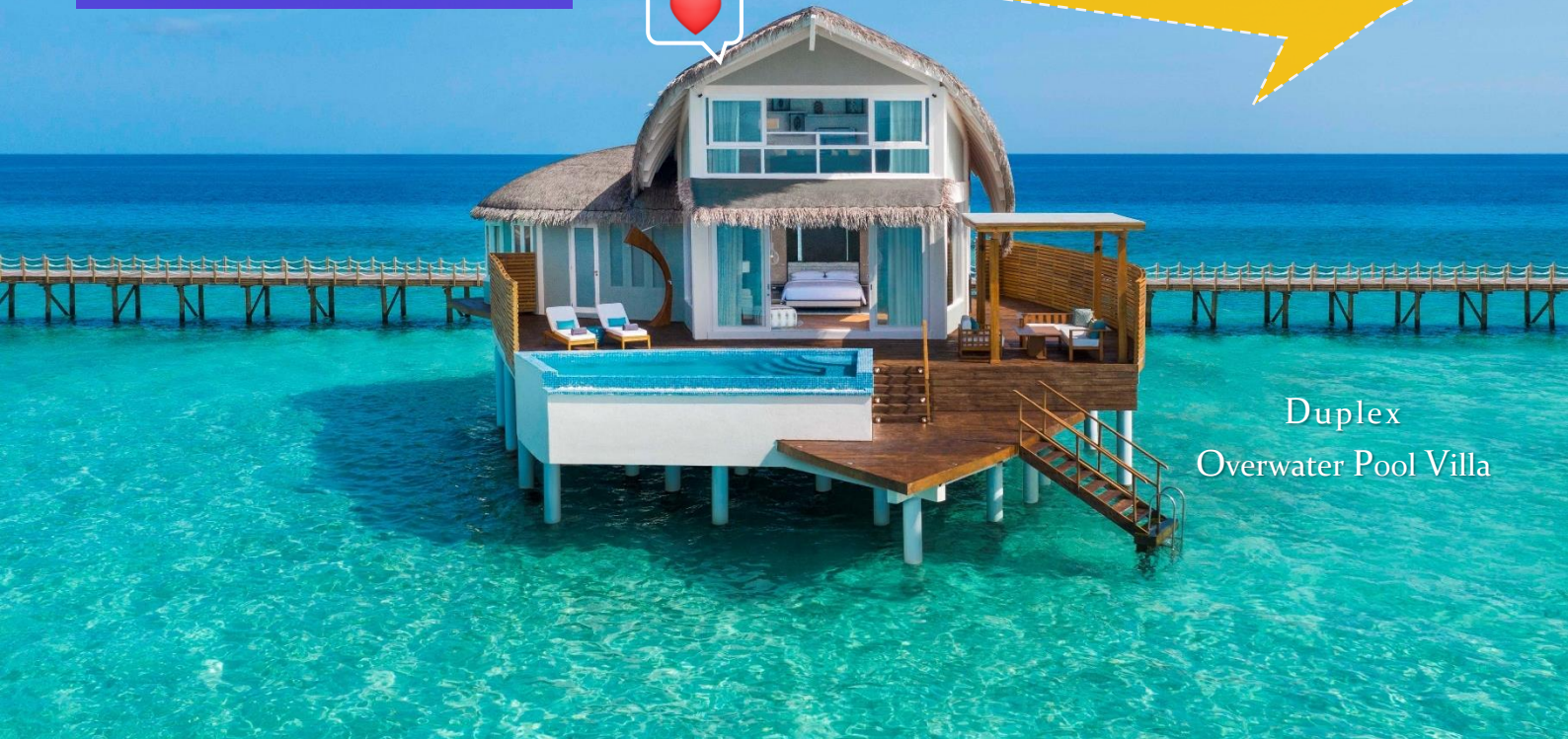
Duplex Overwater Pool Villa