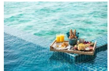
Floating Breakfast Once