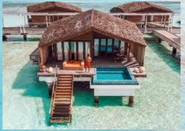
Sunrise Over Water Villa